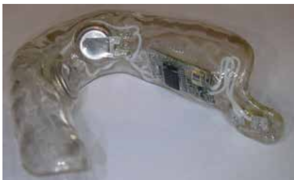
Fig. 3. The GenNarino device with the rectangular electronic circuit on its right side and the round battery on the anterior part. A pair of stimulating electrodes protrude from the buccal surface on the extreme right side extension (not shown in this lingual view-picture). The latter are positioned in such a manner that they are in contact with the oral mucosa in the mandibular third molar area, in the immediate proximity to the lingual nerve. As the flange is separated from the mucosal surface, the electrodes don’t prick the tissue.

Note that sympathetic nerves can be expected to act on the glands as well, as an effect of the stimulation of the reflex arc. Reflexly elicited sympathetic impulses, originating from the upper thoracic paravertebral sympathetic trunk, reach their targets via sympathetic nerve fibers following the arteries of the glands; the relay between pre- and postganglionic sympathetic fibers is the superior cervical ganglion. However, the minor glands are thought to lack a sympathetic innervation of their acinar cells (12).