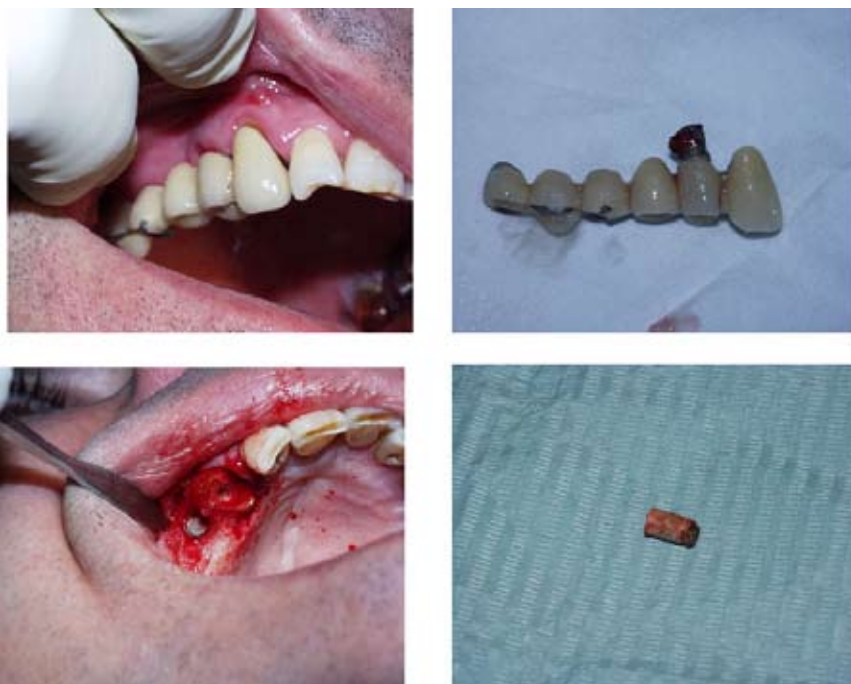
Fig. 2. Clinical examination of an implant fracture patient, showing inflammation and plaque accumulation. Trephine explantation was carried out.

On the other hand, bone loss surrounding the implant appears to be a constant finding. In some cases this can be evidenced radiographically before actual fracture is observed. Such marginal bone reabsorption seems to be